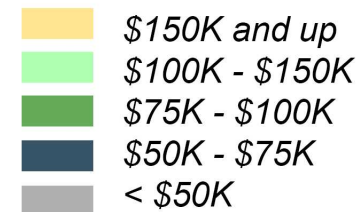
Average Household Income by Block Group

Trade Area Systems, Updates of 2010 Census Data by Synergis